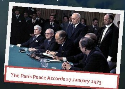
The Paris Peace Accords 27 January 1973