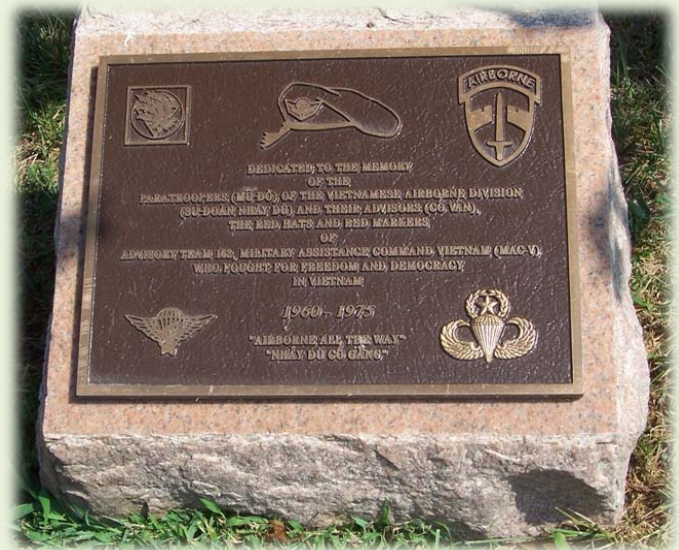
The Vietnamese Airborne Division Marker