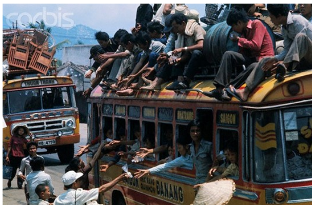
From Vung Tau