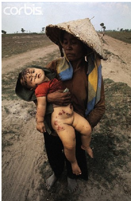
From Long Khanh