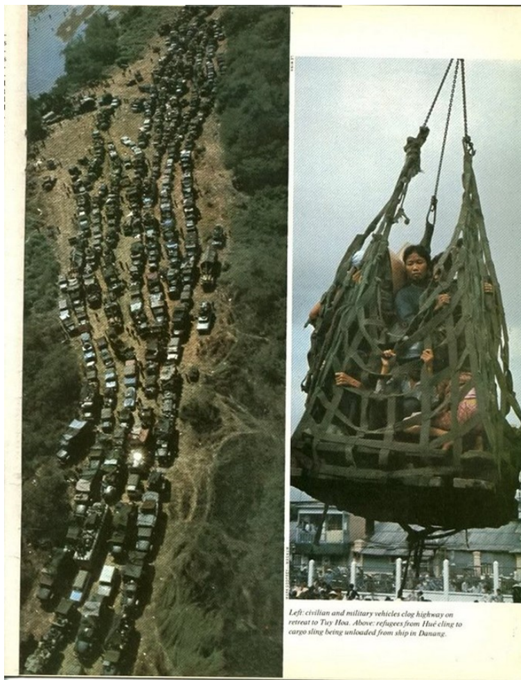
Left: civilian and military vehicles clog highway on retreat to Tuy Hoa. Above: refugees from Hue cling to cargo sling being unloaded from ship in Danang.